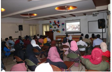
Online inauguration of BMMC by Dr. KT Jaleel (Education Minister)