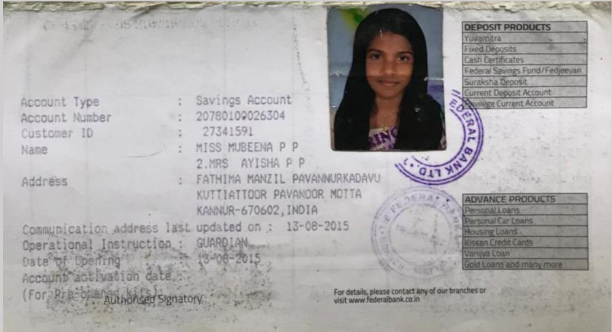
Front Page of the Bank Pass Book