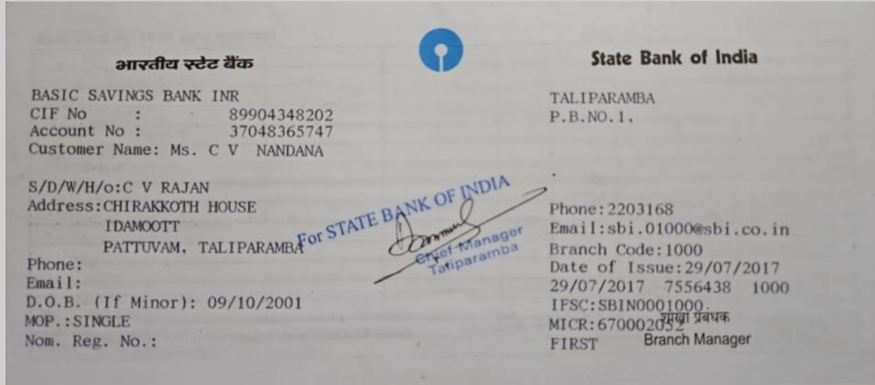
Proof of Amount Transfer