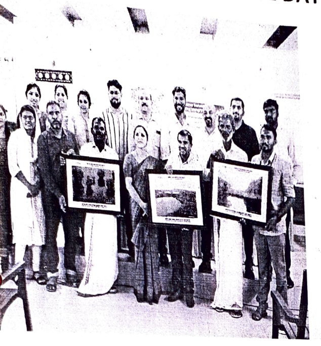
NTERNATIONAL MANGROVE DAY CELEBRATION-26/07/2023