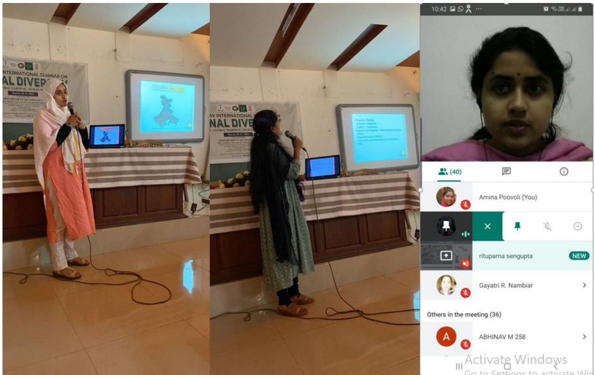
Paper presentation competition by participants (offline and Online)